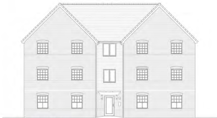
PLOTS 322-327 REAR ELEVATION