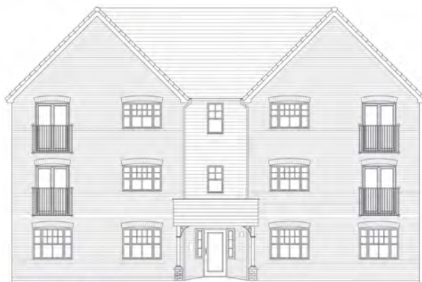
PLOTS 322-327 FRONT ELEVATION