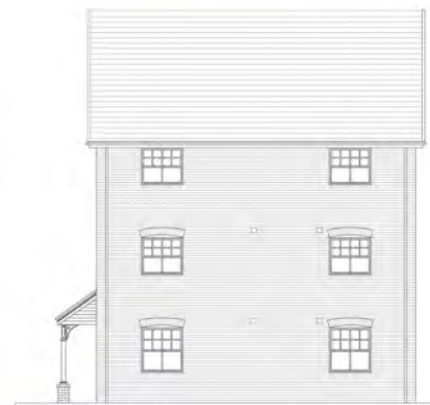
PLOTS 322-327 SIDE ELEVATION