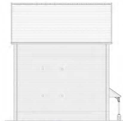
PLOTS 322-327 SIDE ELEVATION